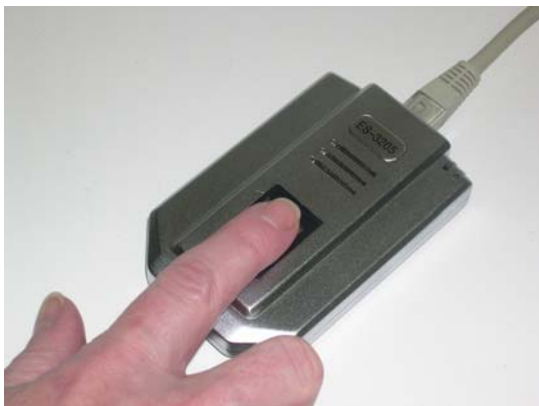
Finger Identification Scanner

Well, you can. identiMetrics' biometric fingerprint identification product, identiFi™ , will eliminate your problem and insure that each member is quickly and positively identified in a safe and cost-effective way.